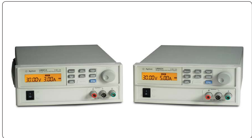
Figure 1. The U8001A 90 W and U8002A 150 W single output DC power supplies